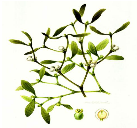
European Mistletoe ( Viscum album )