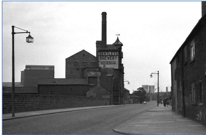
Bentley's Brewery Canklow Road