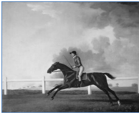
The Bay Malton by Stubs