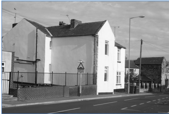
The Bay Horse, now a private house, in 2010